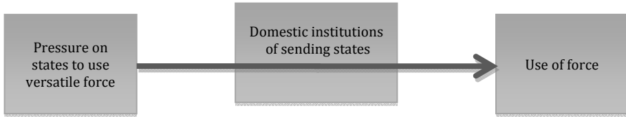
Figure 2: Understanding the use of force in international intervention

torn countries, and in particular democracies. Yet these factors do not determine the way intervening states use force; they constrain policy options, but only so much. To paraphrase Carl Schmitt, actors are sovereign that draw distinctions between internal and external security, crime and war, and police and military work, and that define security priorities, security paradigms and levels of force.