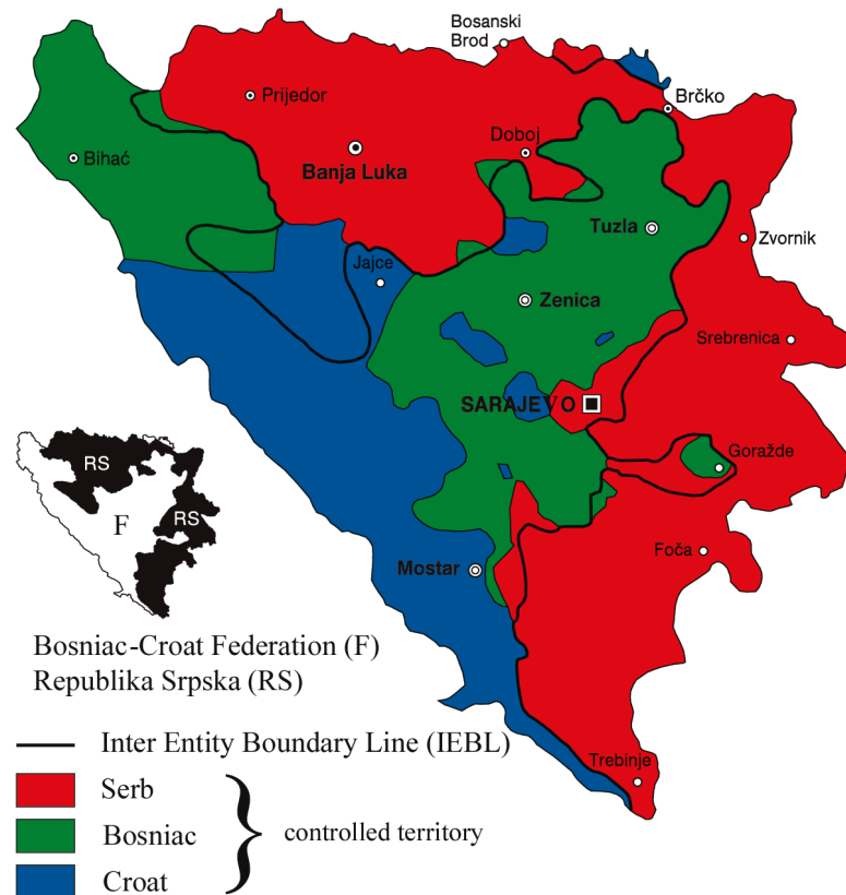
Map 1 (Political/Security/Administrative Shape of BiH)

Bosnia and Herzegovina currently has 15 criminal law enforcement agencies. For a state the size of BiH this represents an unsustainable and illogical approach to crime fighting.