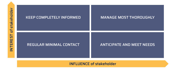
Figure 1: Stakeholder map. Who needs what? Who should you engage, and how often?