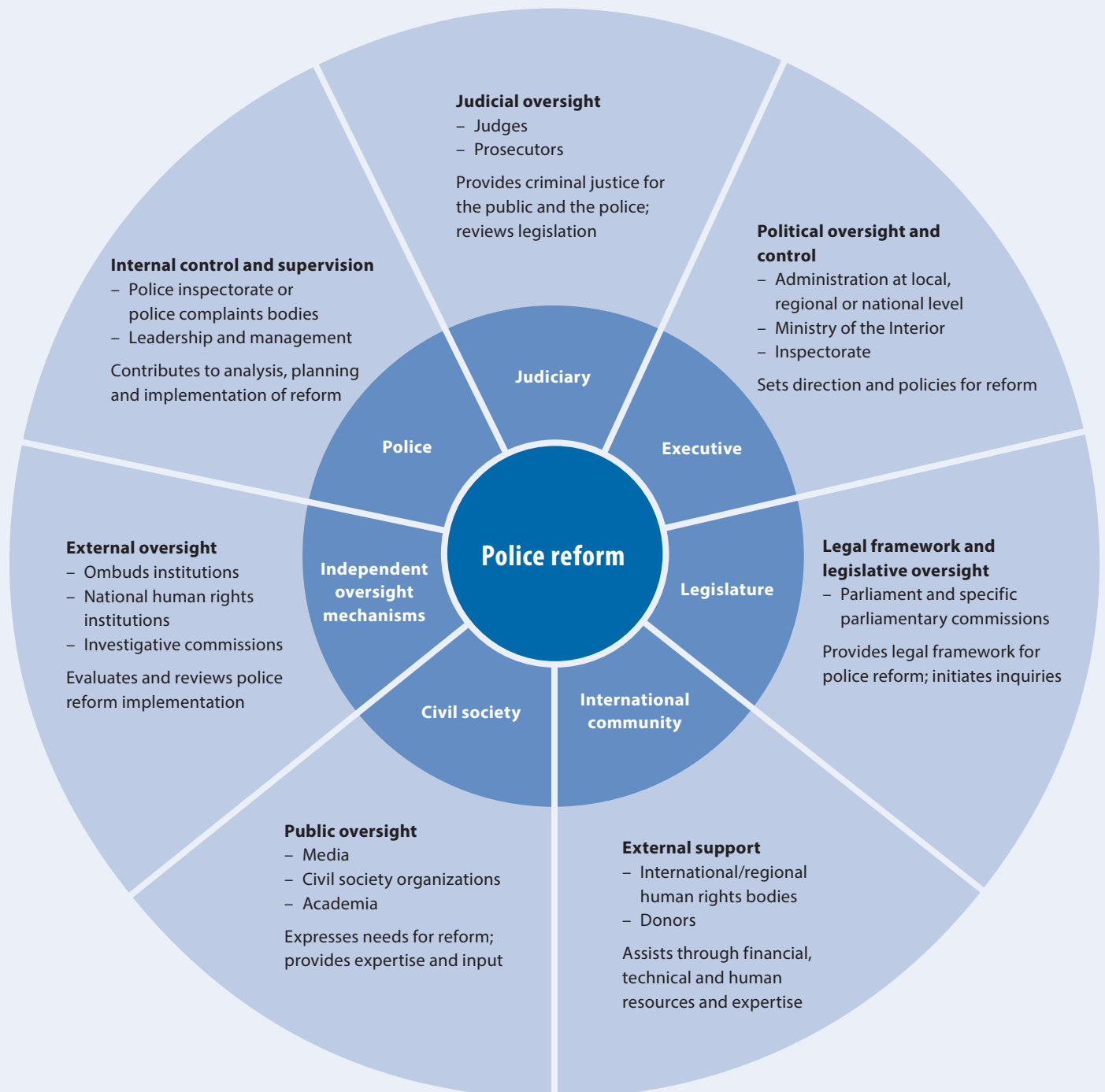
Figure 1 Police reform involves a variety of state and non-state actors