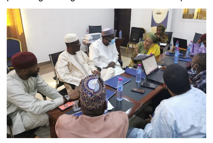
Self-assessment workshop in May 2021 to identify parliamentary capacity building and legislative needs.

sector, DCAF focused primarily on enhancing DSC's institutional and oversight capacity on key issues such as security sector governance, legislative processes, and budget oversight, as well as on improving the relations between the parliament and civil society, the population, and the media by supporting field missions and providing training on communication techniques.