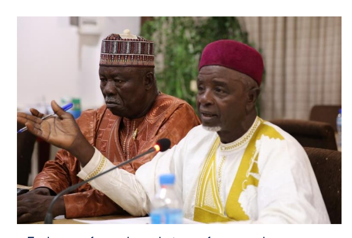
Exchange of experience between former and new members of the Defence and Security Commission (DSC) of the National Assembly, October 2021

the Nigerien government to reallocate resources to bolster operational activities of the defence and security forces (DSF), the consolidation of security and defence governance structures has become an urgent strategic necessity for the stability of the country. Most importantly, this means providing sufficient resources and political support to enhance the accountability and effectiveness of state security institutions through the implementation of strong internal and external oversight mechanisms.