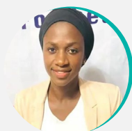
Halimatou Dibba, Commissioner, NHRC of The Gambia